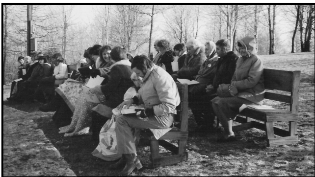
One of the first Sunrise Services.