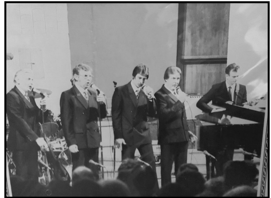
"The Lord's Quartet"