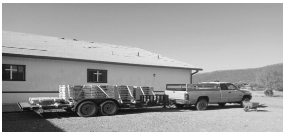
New roofing will be put on soon.

We appreciate those of you who have been supporting our mission work and ministry with your financial and prayer support. Thanks for being a part of this vital outreach phases of Gospel Hill Ministry.